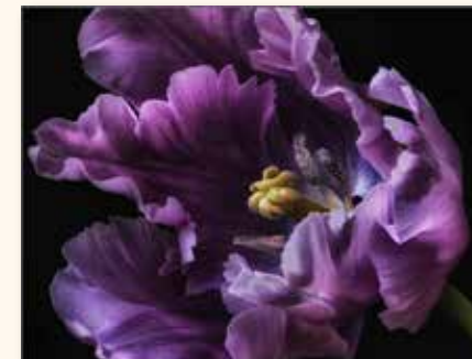
Joyce Blumenthal, First Purple Tulip