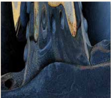
Lois Barker, Second Story in Blue