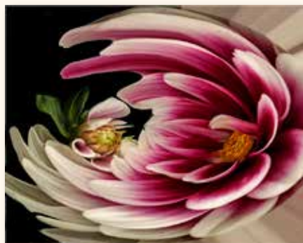
Joyce Blumenthal, Second Swirling White Flower