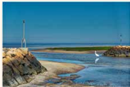
Voyin Hrnjak, HM East of Prleans