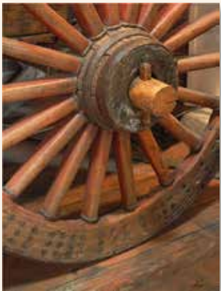
Adelaide Boemio, Second Wagon Wheel