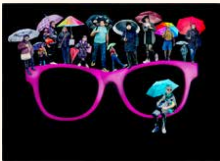
Anastasia Tompkins, Third Umbrella Parade