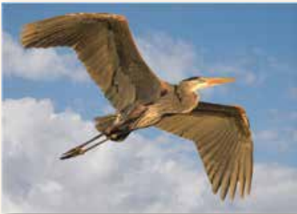
Roger Chenault, Third Great Blue Herron