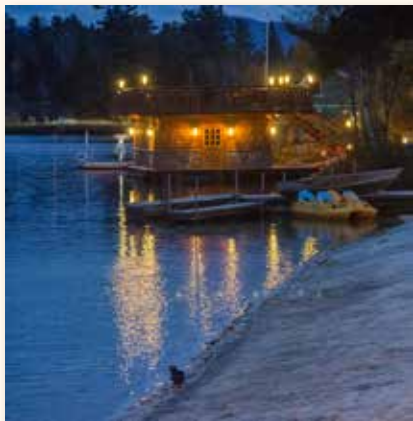
Melanie Rush, HM Beach at Dusk