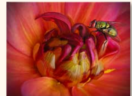
Joyce Blumenthal, Third Fly On Red Flower