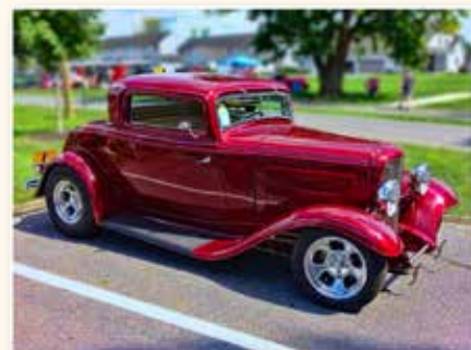
Rafael Molina, HM Li'l Red Coupe